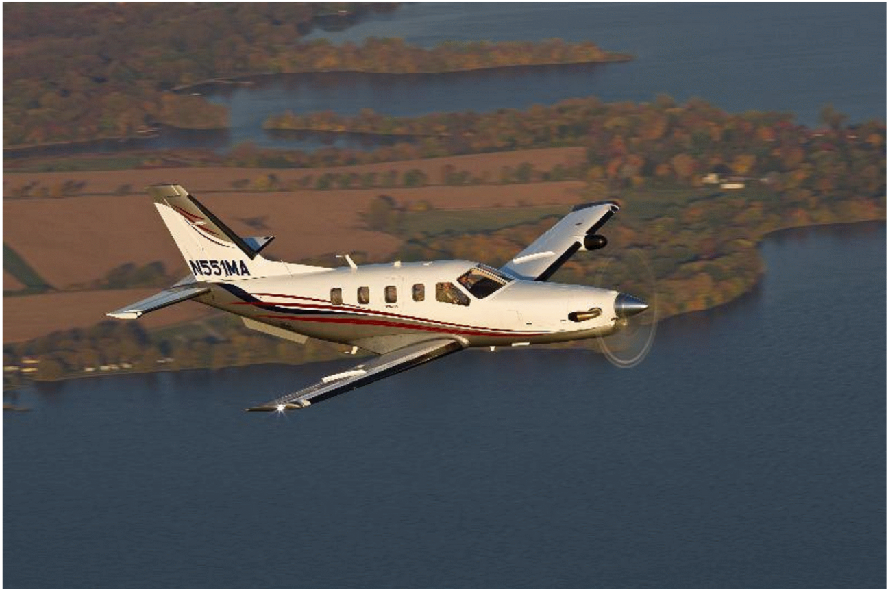
Brian Dunsirn TBM 850, SN 516

Your Source for TBM Market Intelligence since 1996!