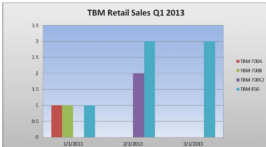
TBM Sales January to March 2013

Here is a graph of TBM sales over the last two months.